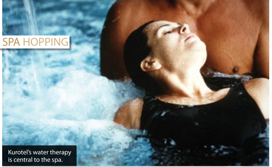
Kurotel's water therapy is central to the spa.