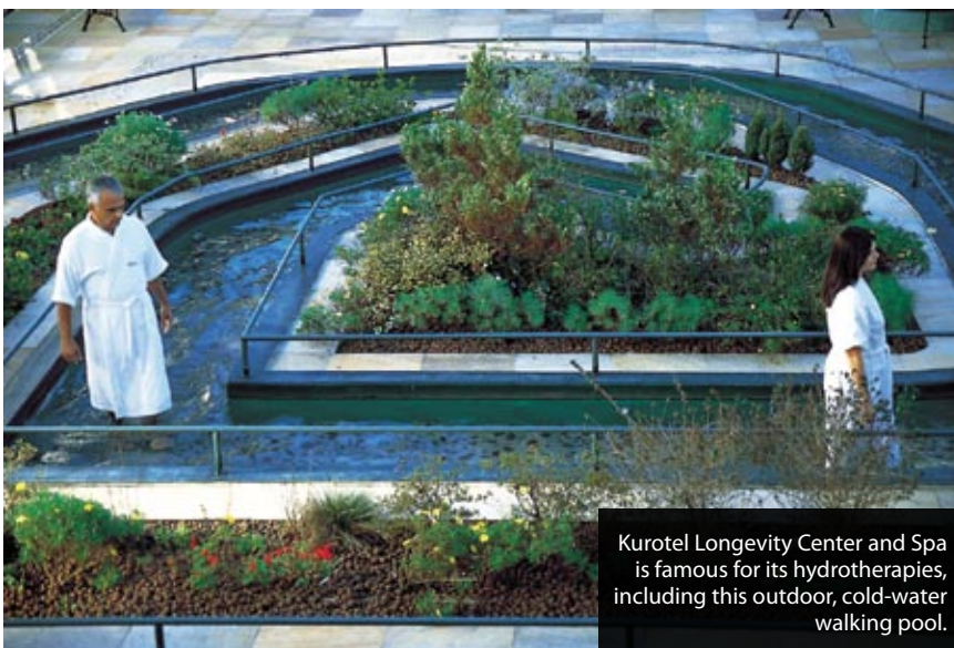
Kurotel Longevity Center and Spa is famous for its hydrotherapies, including this outdoor, cold-water walking pool.