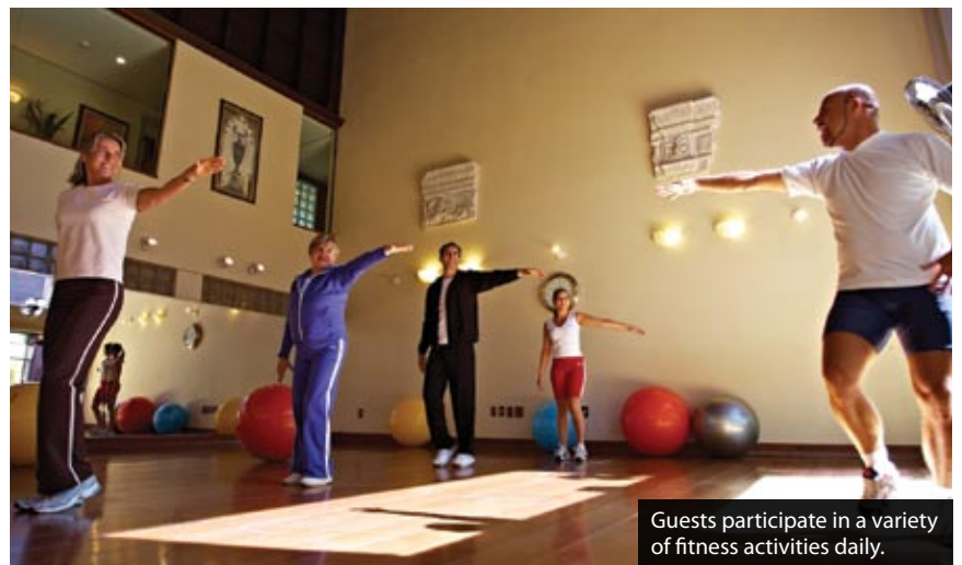
Guests participate in a variety of fitness activities daily.

It was also difficult adapting to a diet of 800 to 1,200 calories per day. While I mourned the box of emergency chocolates I packed in my suitcase, I learned to love the Kurotel diet. Well, at least the results. It's a custom cuisine of freshly prepared, organic meals which are pleasing to the eye and palate. Snacks are provided four times a day, which include a few dried apricots or nuts, or maybe a couple ounces of a fruit smoothie. The small portions help curb headaches and hunger pangs.